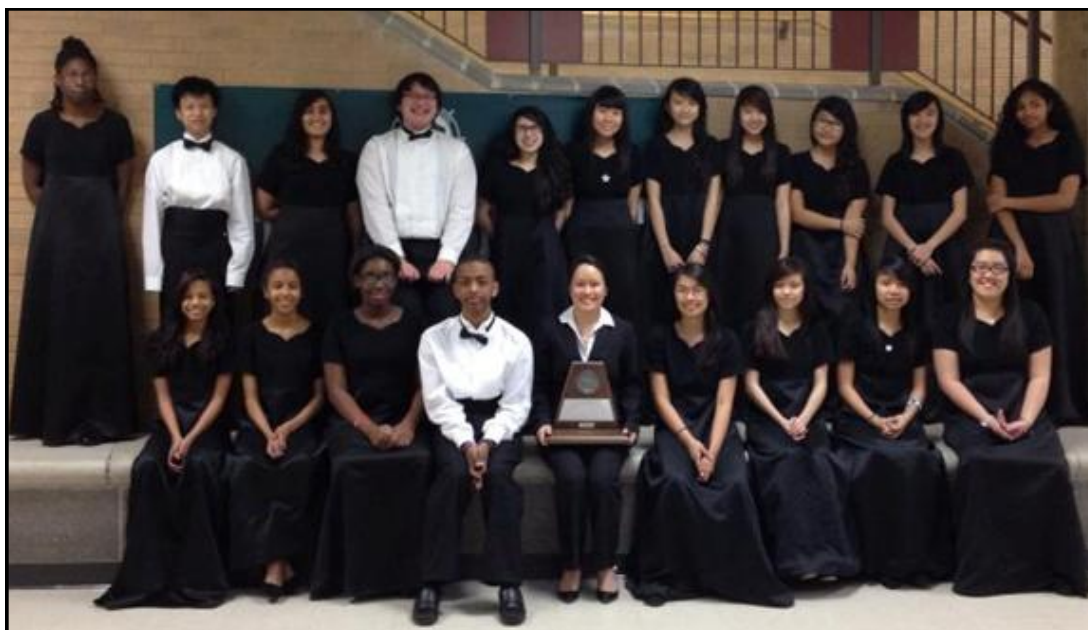
Liberty Advanced Orchestra