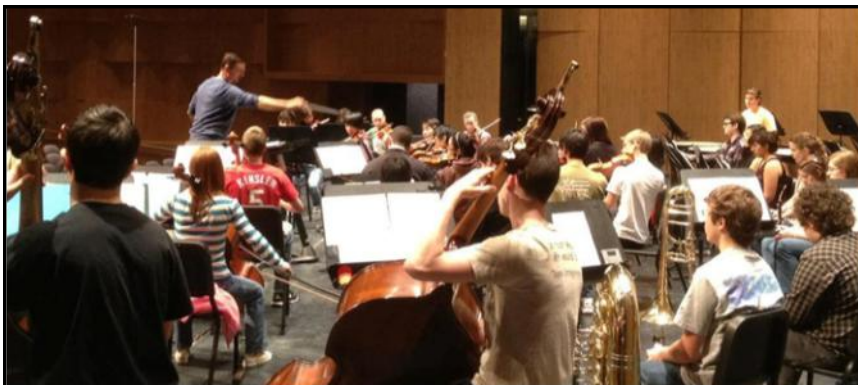
Above: The Symphony Orchestra had the privilege of performing in the new Allen Performing Arts Center at Allen High School on February 25. A talented Orchestra playing Tchaikovsky, in a world class Hall! What an experience!

Both the Philharmonic and Symphony performed as a full orchestra with winds and percussion. Berkner is one of the few schools in the state able to field two full orchestras!