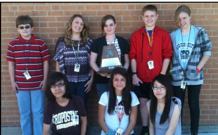
Above: Officers and section leaders from the Apollo Symphony Orchestra with their UIL Sweepstakes trophy

Both the Symphony and Concert Orchestras performed at UIL Concert and Sightreading Contest held at Poteet High School on March 8 and 9. The students in both orchestras played beautifully on stage and in the sightreading room, resulting in a first division rating from all 6 judges . The orchestras were proud to take two sweepstakes trophies back to Apollo.