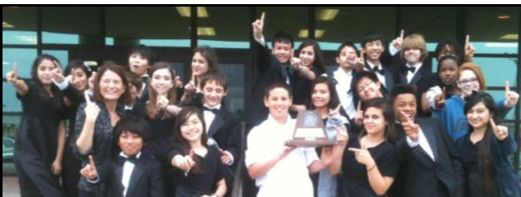
Above: Concert Orchestra with their sweepstakes trophy at UIL